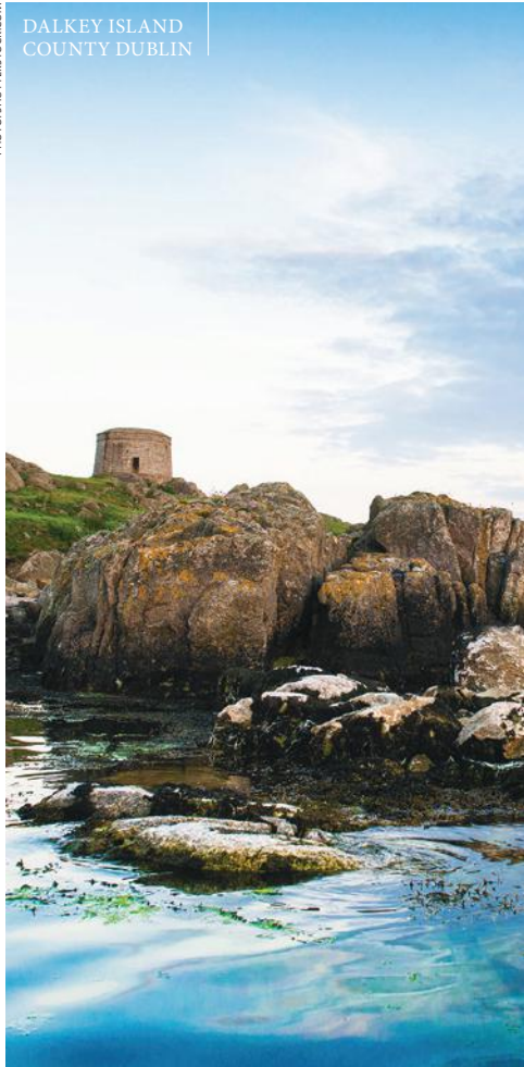
DALKEY ISLAND COUNTY DUBLIN