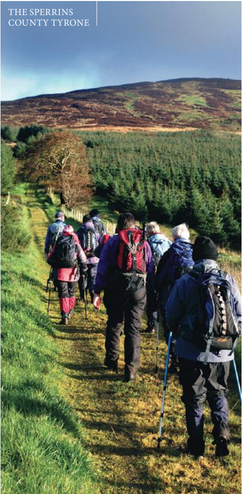
THE SPERRINS COUNTY TYRONE

No matter where you cycle on Ireland's Greenways you'll be assured of a gentle way of seeing dramatic sights. And the great thing about going by bicycle is that you always get a seat with a good view. ♥