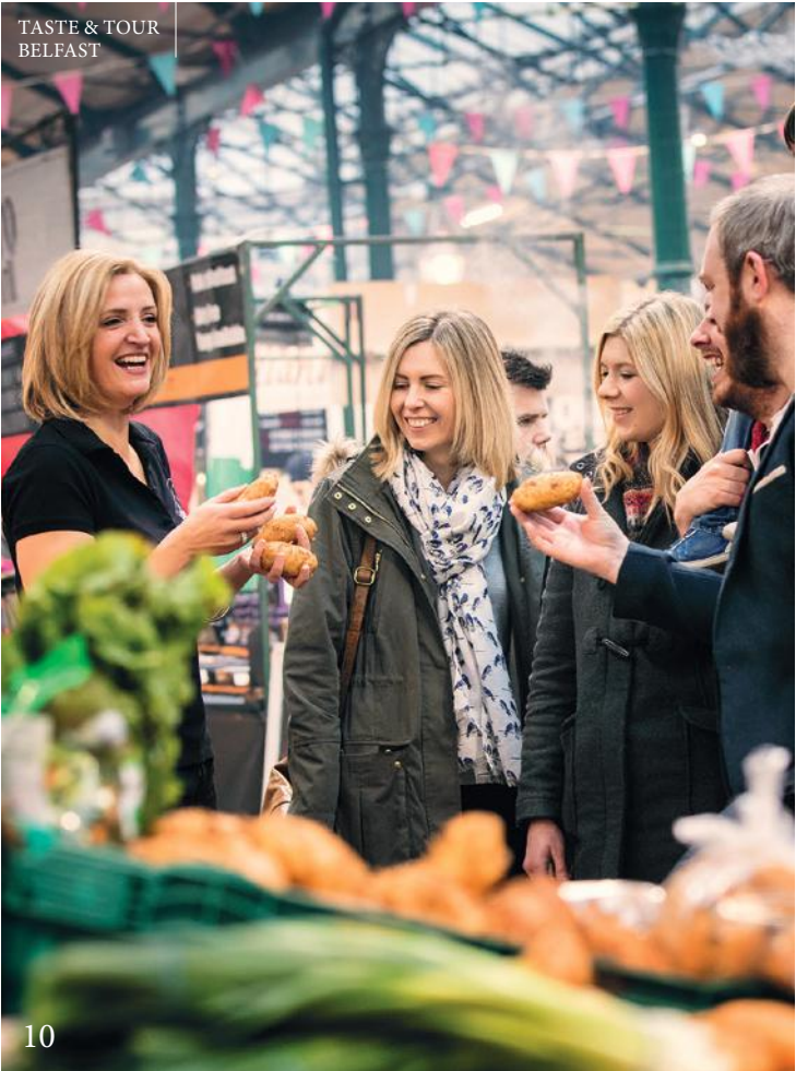
TASTE & TOUR BELFAST

From its origins in the late 1970s, Ireland’s farmhouse cheese scene has grown into one of the most exciting in Europe, with punchy new styles, including Young Buck raw milk blue cheese and well established favourites such as Durrus, Killeen and St Tola. A visit to a cheesemaker, such as Cashel Farmhouse Cheese in County Tipperary, is a great way to find out more about the cheese-making process, and farmers’ markets are ideal for meeting local producers and tasting artisan products. The flavours of the shoreline are showcased on the Taste the Atlantic trail along the Wild Atlantic Way, with tours of smokehouses, seafood producers and oyster farms. Keep your eye out in restaurants all along the island’s coastline for smoked Atlantic salmon, oysters, mussels and crab. It’s not just the fine-dining restaurants or traditional pubs where you can sample the ocean’s bounty, either. Enjoy fish fresh off the boat at Harry’s Shack on Portstewart Strand in County Londonderry or award-winning chowder at Killybegs Seafood Shack, overlooking the fishing port of Killybegs in County Donegal. For something a little different, make sure to try some of the island’s seaweeds, such as dulse or carrageen moss from the Antrim coastline. And with a new generation of well-travelled chefs eager to explore the island’s extraordinary natural larder, enjoying the great tastes of Ireland has never been easier! ♥