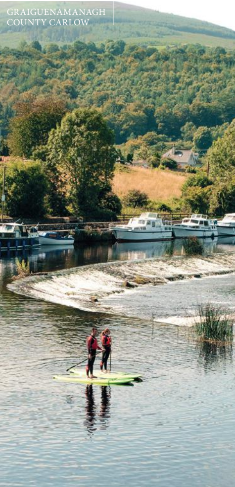
GRAIGUENAMANAGH COUNTY CARLOW