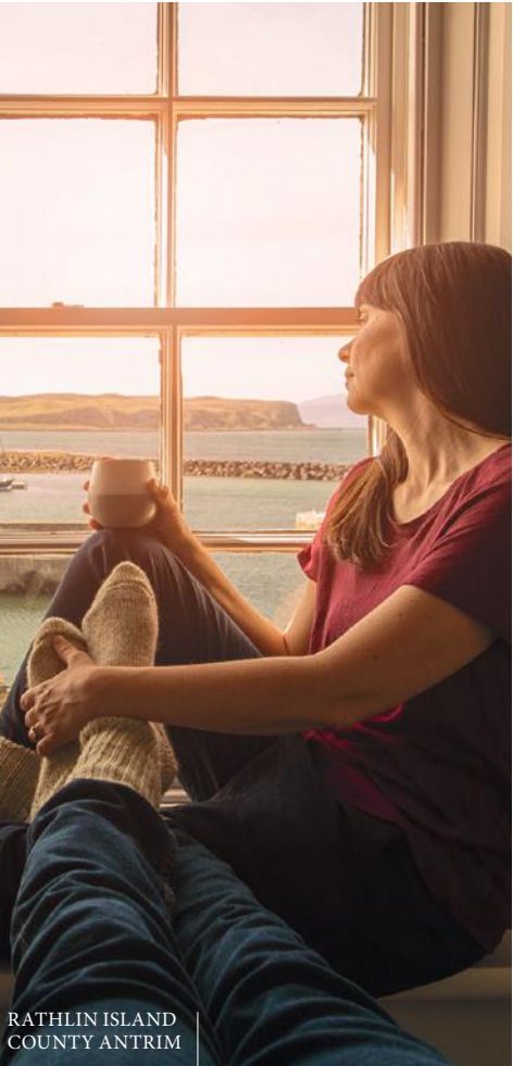
RATHLIN ISLAND COUNTY ANTRIM