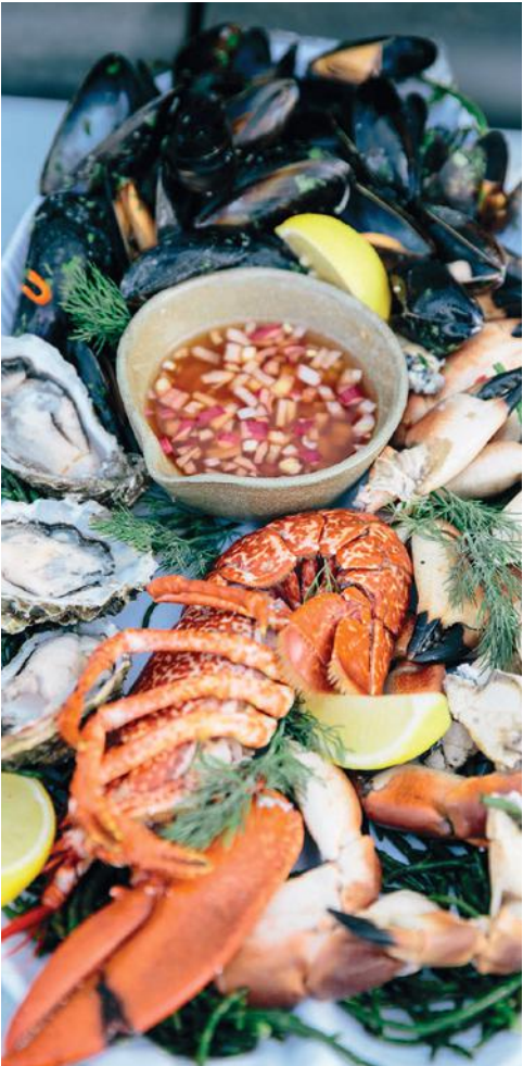
TASTE THE WILD ATLANTIC WAY