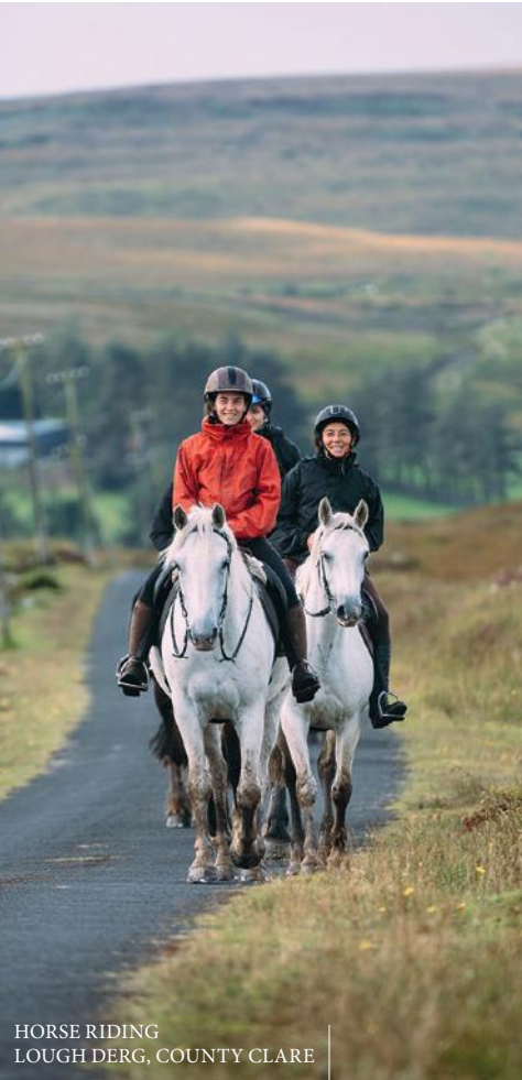
HORSE RIDING LOUGH DERG, COUNTY CLARE