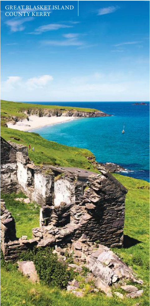
GREAT BLASKET ISLAND COUNTY KERRY

Sites like this can look out of place, plonked seemingly inexplicably within valleys or in the middle of tiny islands. But the more you familiarize yourself with Ireland, you'll see that these structures, soaked in history and witness to thousands of years gone by, are exactly where they should be. ♥