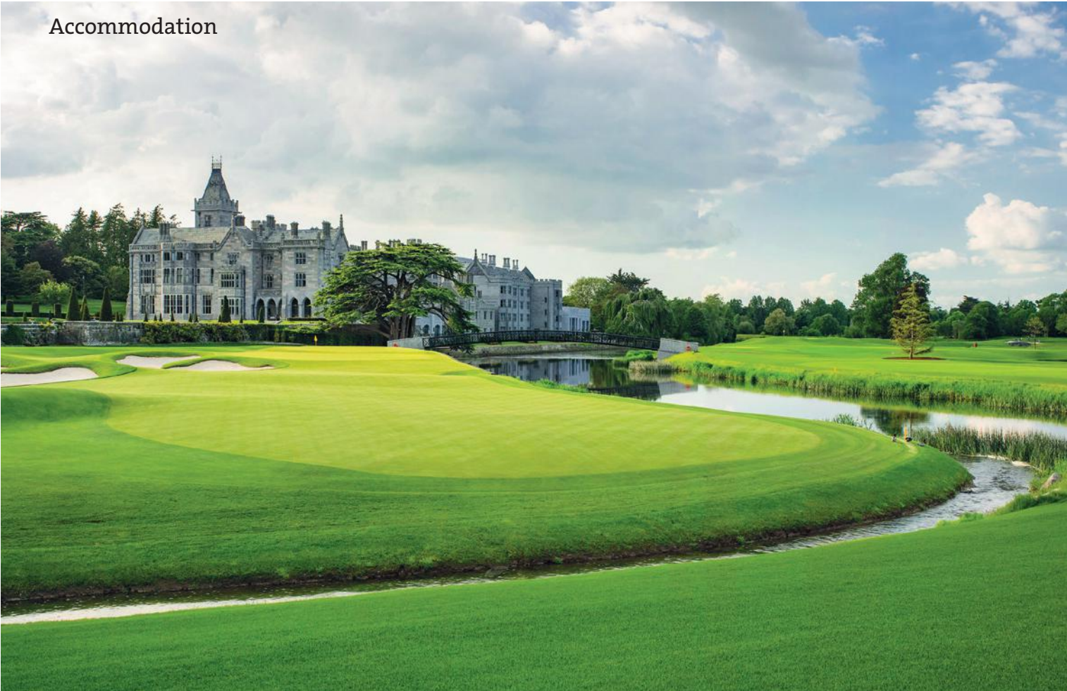
ADARE MANOR COUNTY LIMERICK